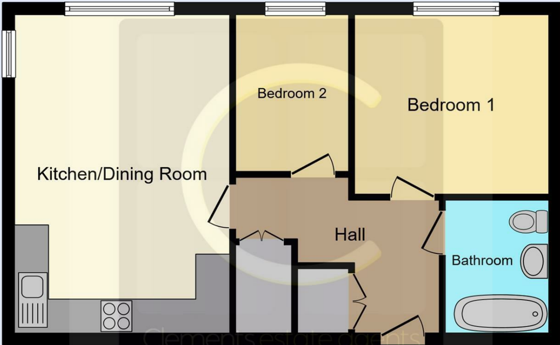
Floor Plan Floor area 52.9 m 2 (569 sq.ft.)